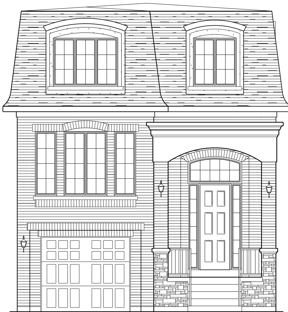
FRONT (EAST) ELEVATION